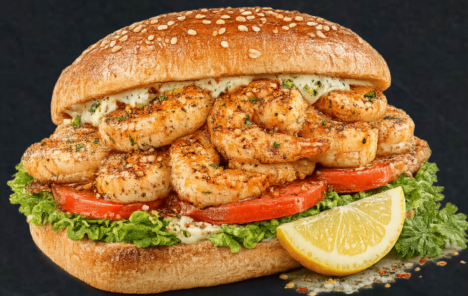
CAJUN BUTTER SHRIMP BURGER