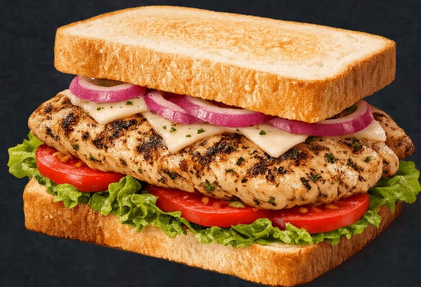
HERB-MARINATED GRILLED CHICKEN SANDWICH