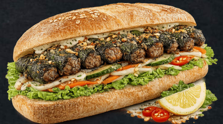
CHARCOAL-GRILLED BETEL LEAF BEEF BÁNH MÌ