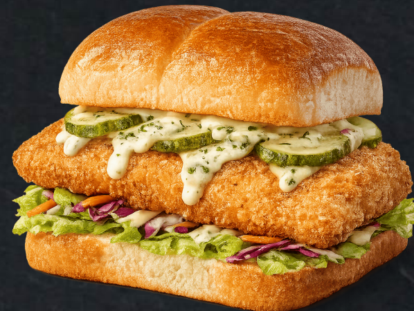
CRISPY FISH FILLET HAWAIIAN ROLL